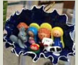
The Hand to Hand Gift Shop is full of fantastic ideas for holiday presents! Top: A chef-inspired gift basket. Right: Nativity ornaments.